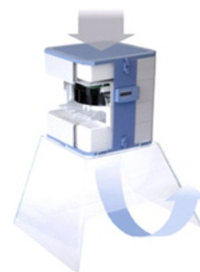
Clean Air Hood