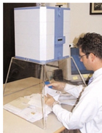
IQAir CleanZone H13 shown in a mail room environment

For more critical control of gaseous compounds see our GC Series models.